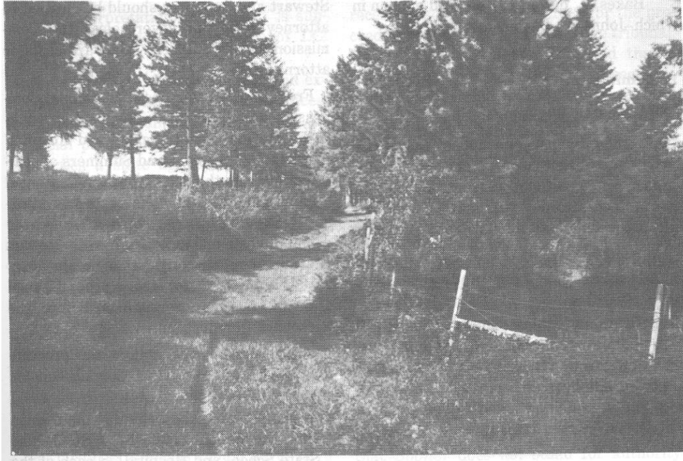
Figure 1: Photograph of “Public Road 460” published as part of the Court’s decision in Taggart v. Highway Bd. for N. Latah Cnty. , 115 Idaho 816, 820, 771 P.2d 37, 41 (1988) (Shepard, C.J.). It is difficult to see in this reproduction, but there is grass growing in this roadway.