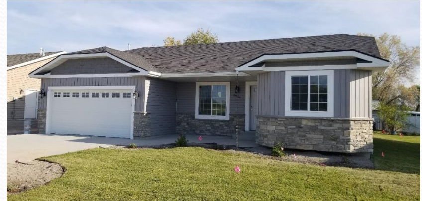
Sapphire Plan~ 4-Bedroom/2 -Bath 1414 square feet