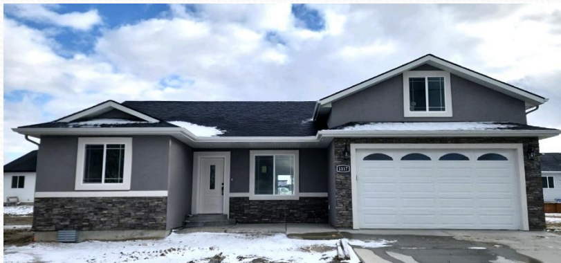
Diamond Plan~ 4-Bedroom/2-Bath 1621 square feet