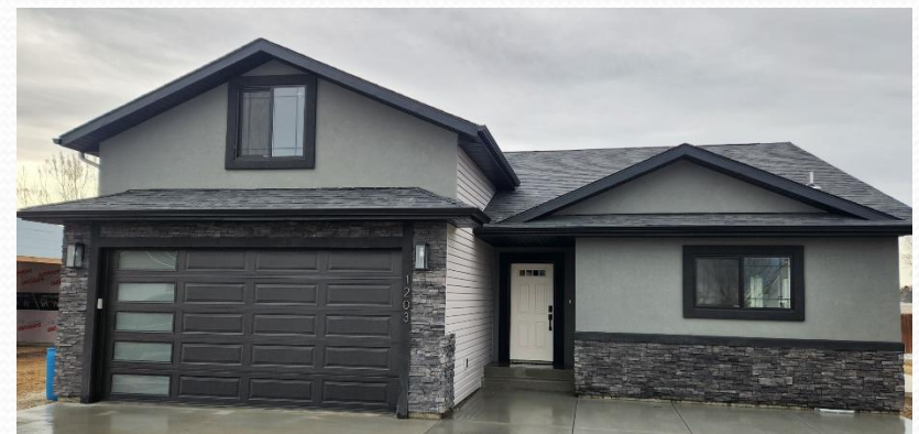
Onyx Plan~ 4-Bedroom/2-Bath 1651 square feet