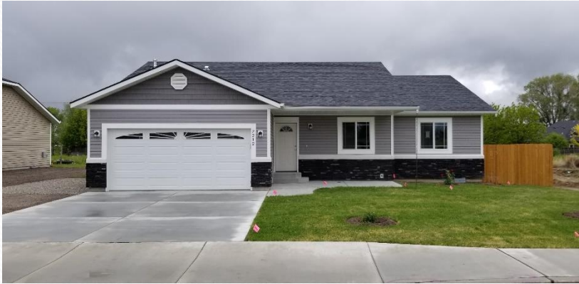
Amethyst Plan~ 4-Bedroom/2-Bath 1508 square feet