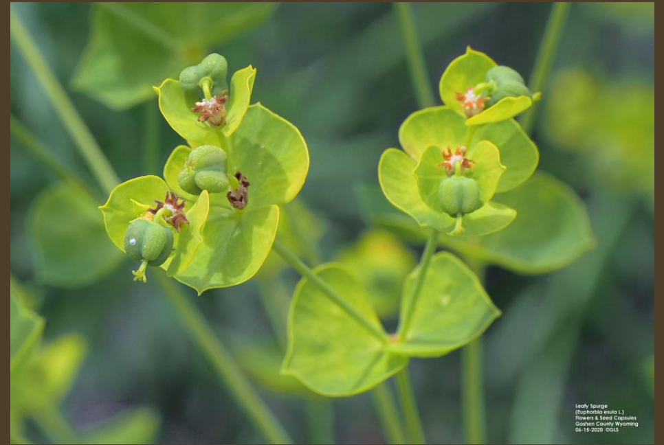
Leafy Spurge ( Euphorbia esula L.) Flowers & Seed Capsules Garden County, Wyoming 06-16-2020 DGJL

Reproduces by seed Viable up to 5 years and by the root system.