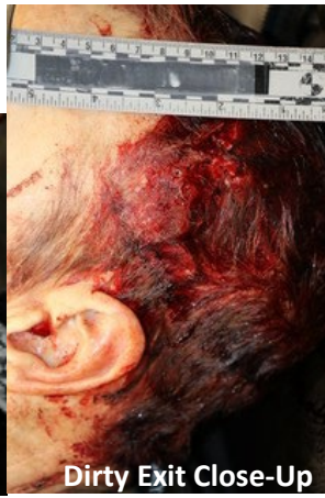
Dirty Exit Close-Up