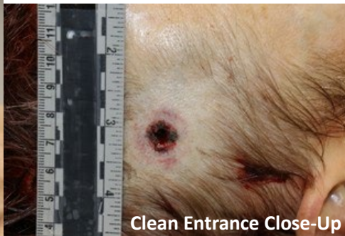
Clean Entrance Close-Up