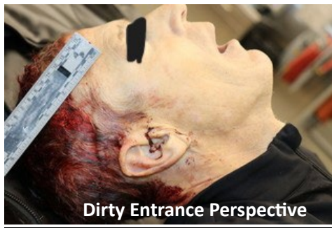
Dirty Entrance Perspective