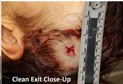
Clean Exit Close-Up