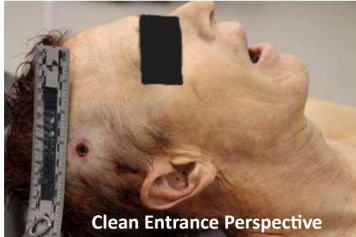
Clean Entrance Perspective