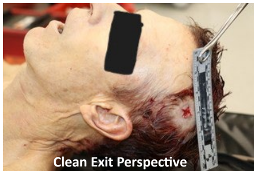
Clean Exit Perspective