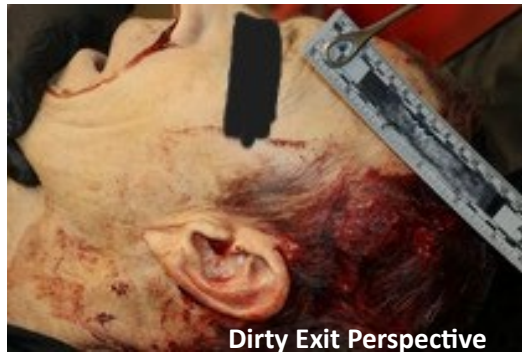
Dirty Exit Perspective